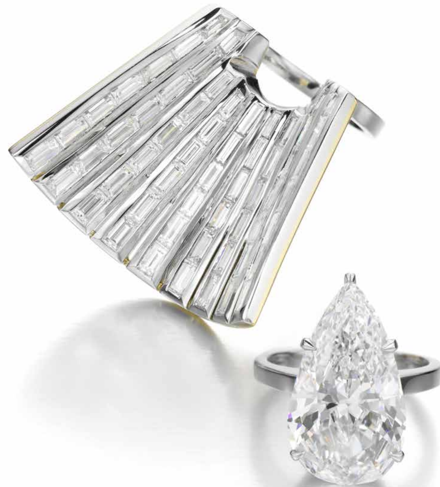
'The Cape Party Jacket Ring' handcrafted in platinum and backed with 18K yellow gold, set with fifty graduated baguette-cut diamonds (total weight of 7.60 carats), is designed to sit with the 'Pear Shape Diamond Ring' in platinum set with an 8.18-carat D / SI1 pear shape diamond. POA.